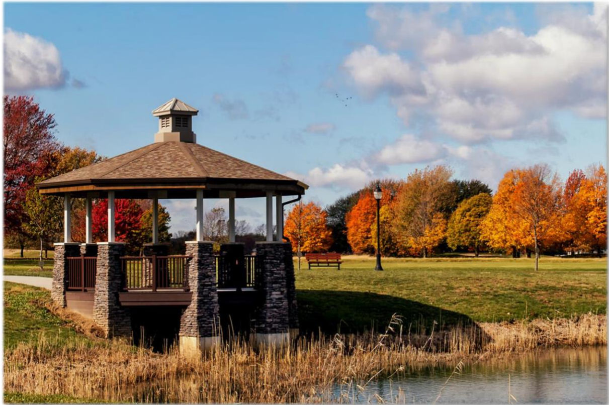
Sherman Village Park Gazebo in the fall.